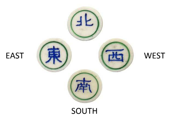
Fig.8 – Mingg, Four Wind discs.

The Mingg and the four Wind Discs will be found useful the position of each Wind during the play and used in drawing for seats and keeping track of the number of round played.