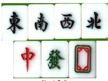
Fig.4 & 5

The beginner should study the tiles and be able to classify correctly all the tiles in the set before proceeding with the play. The design of the one bamboo (a bird) and the one circle (a wheel) should be noted carefully so that no confusion occurs in assigning these tiles to their proper suits.